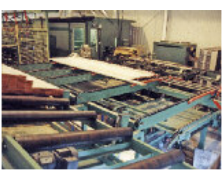
New machining mill - Epping

Since 1997 Hoppings has become one of the U.K.'s leading suppliers of machined softwood and this is in part due to our focus on making investments at the right time at both depots. We firmly believe that the money we have spent on infrastructure and machinery over the last 12 years has enabled us to remain competitive and continually responsive to the needs of our customers. The images here illustrate the more major elements of the investments made since 1997 in which time we have spent in excess of £3.5 million.