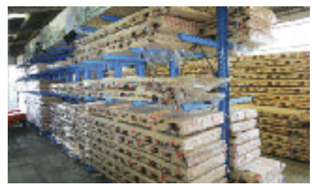
Storage increased & improved for Q-Line® goods - Lingfield