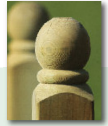
DECKING BALUSTRADING & SUB-FRAME COMPONENTS

A wide range of high quality treated softwood decking balustrading components including a strength rated system. Also 'fit for purpose' deck sub-frame joists and posts. Available as FSC® or PEFC certified on request.