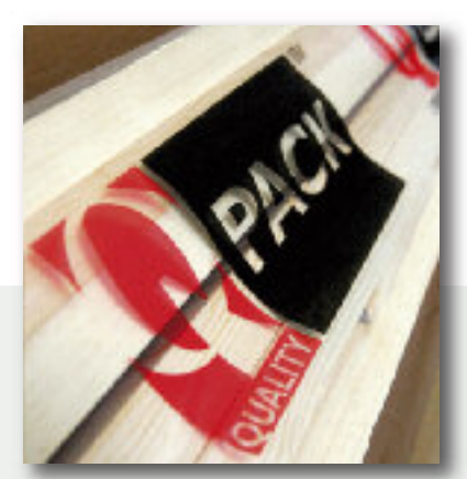
Our convenient trade packs of mouldings and PSE sections are called Q-Pack®. Q-Packs are our set piece packs of very approximately one cubic metre of a product, providing a price advantage without compromising on quality.