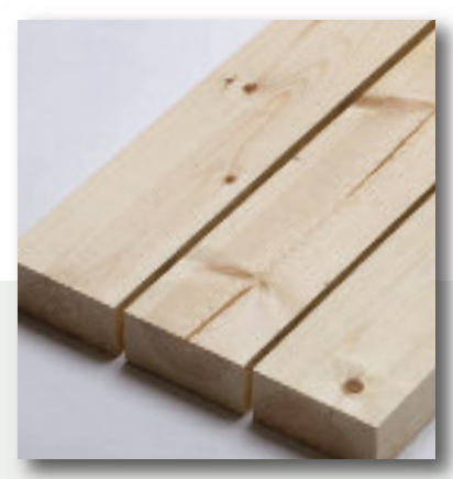
A range of popular PSE sections in set pre-cut lengths.