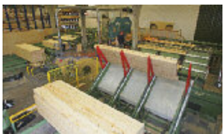
New automated, high speed Stenner re-saw line - Lingfield